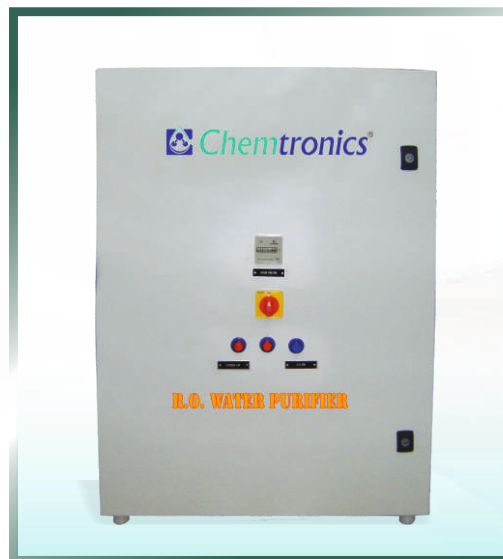
Powder Coated Cabinet