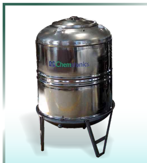
Stainless Steel Storage Tank